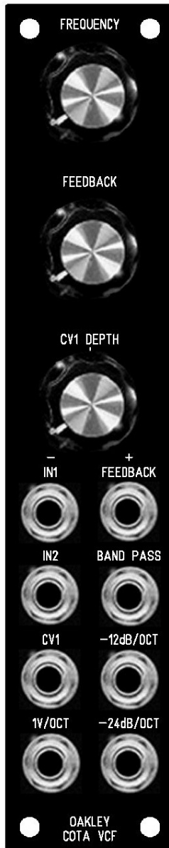
The 1U Filter Core Module in standard MOTM compatible format.