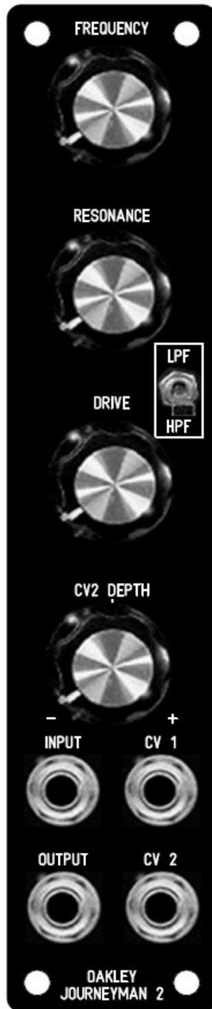
The suggested panel layout for the single width MOTM format module.