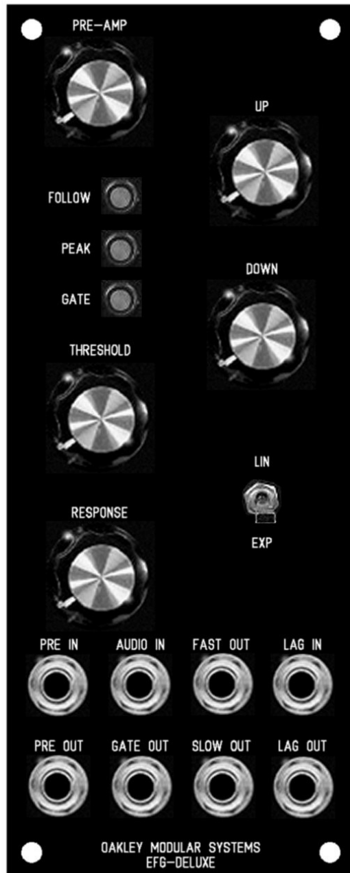
The full 2U version with controllable lag generator called the EFG-Deluxe