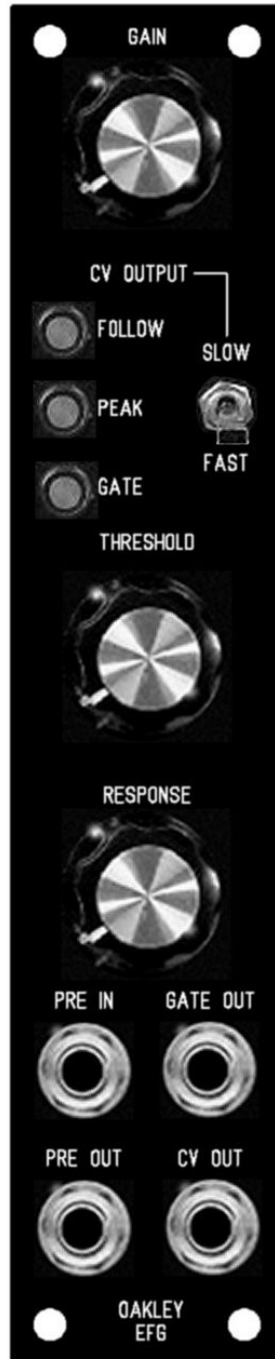
The basic 1U version of the EFG