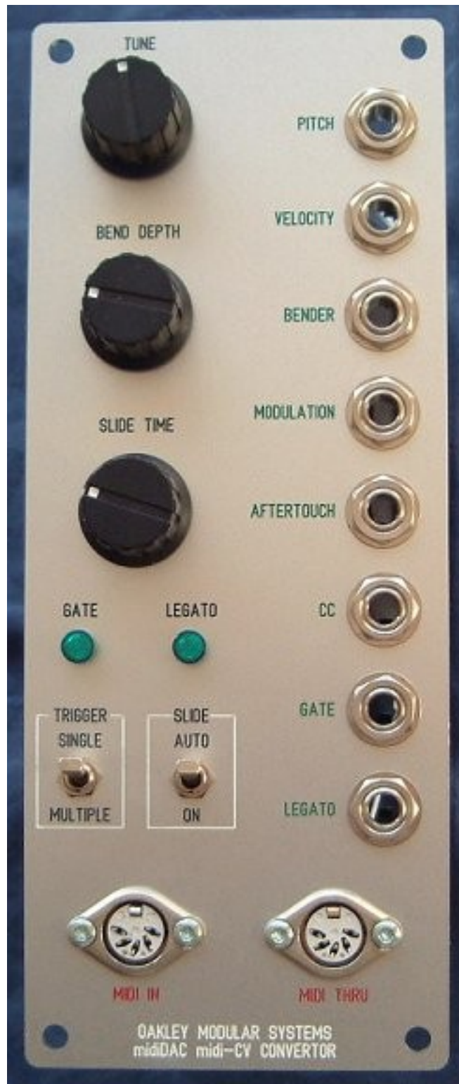
This is the issue 3 midiDAC in a natural finish Schaeffer panel. Note the new rounded corners. The toggle switches are APEM flat blade toggle switches available from Farnell. The round LED holders come from Maplin, whilst the knobs are the Rapid's 'matt black control knobs' for 1/4" fitting.